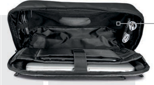
PADDED INTERIOR LAPTOP, TABLET & ACCESSORY POCKETS